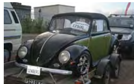
Looks nice, but needed work inside