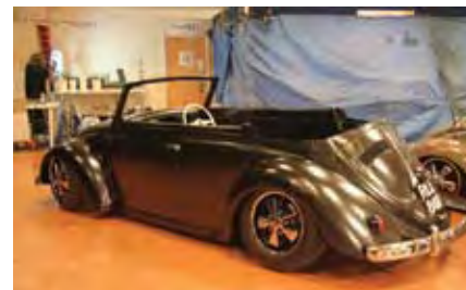
Low'n mean looking!