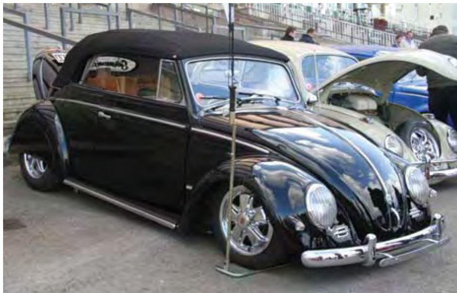
Lovely early Cabrio