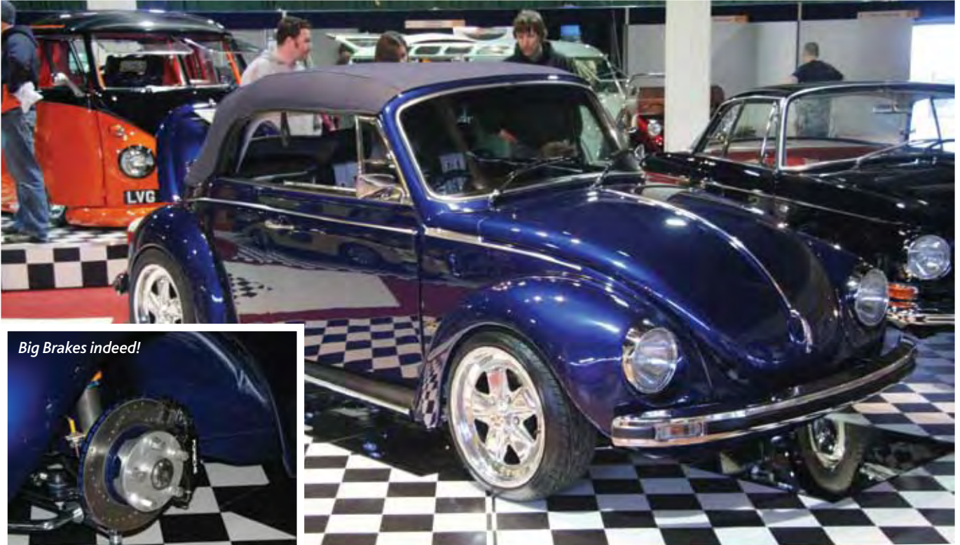
Big Brakes indeed!