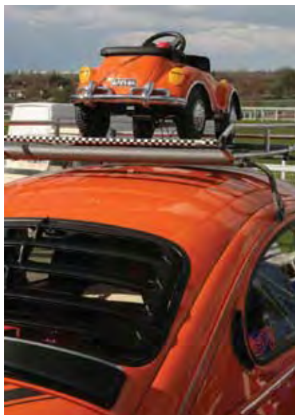
Don't leave your Cabrio out in the rain!