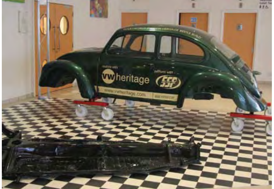
Heritage Beetle, waiting to be built

I do not attend the show every year as, in common with most VW shows, the event follows a long standing format however for those who have not attended this event it is unusual among VW shows in the UK as all the show car, the trade stands and auto jumble are all accommodated in the exhibition halls and rooms above the halls in the main Grand Stand building at the Sandown Park Race course. The VW Club Stand area is located on the spectator standing area in front of the main Grand Stand and a separate Bus and Camper display area can be found arranged around the winners enclosure at the back of the Grand Stand area.